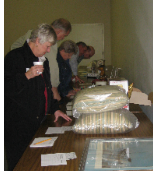
Serious study of the Silent Auction items