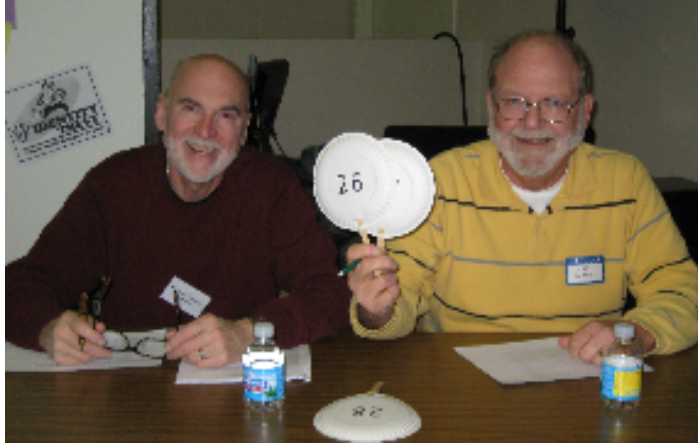
The "paddle meisters"