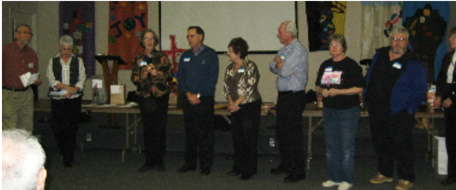
The newest Newcomers enjoy the event